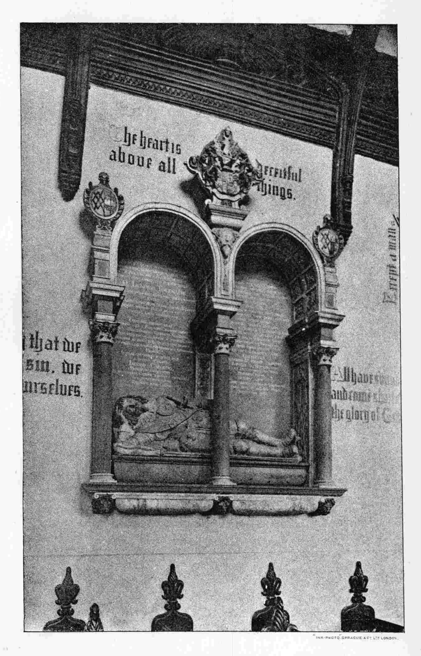
MONUMENT TO SIR LIONEL TOLLEMACHE, HELMINGHAM CHURCH.